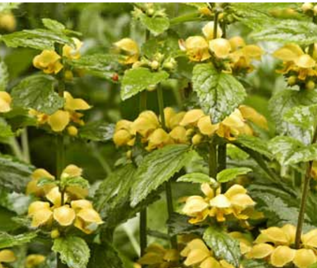
Yellow archangel ( Lamium galeobdolon ) SJCNWCB